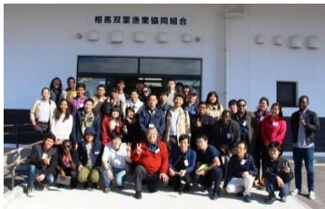
Field trip in Fukushima

Since IIAS was established as Department of International Environmental and Agricultural Science (IEAS) in 1999, we have hosted many international students from Japan, South Korea, China, Vietnam, Cambodia, Laos, Thailand, Myanmar, Malaysia, Indonesia, Mongolia, India, Bangladesh, Nepal, Mongolia, Uzbekistan, Afghanistan, Iran, Kenya, Ghana, Brazil, etc. IEAS and IIAS alumni and students include 22 JDS fellows from Uzbekistan among 108 JDS fellows from Asian countries. They have been playing active roles related with agriculture and environmental fields. We train students to serve as leaders with "field-oriented" mind and skill sets so that they can identify environmental issues and propose effective measures for achieving sustainable development while cooperating with local and global stakeholders in the world.