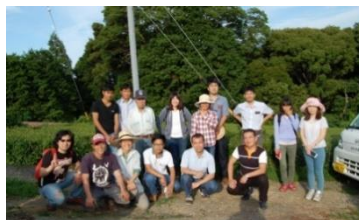
Visit to an organic tea farm in Fujieda, Shizuoka